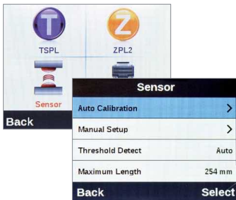
Step 2: Calibrate via Full Colour LCD Display