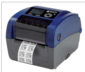
Step 3: Print